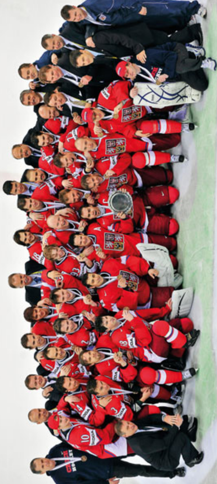
Czech Team 2011 IIHF Ice Hockey World Championship, Slovakia